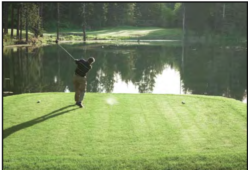
Hawk's Prairie (top) offers two courses; Skamania plays through tall trees and wetlands.