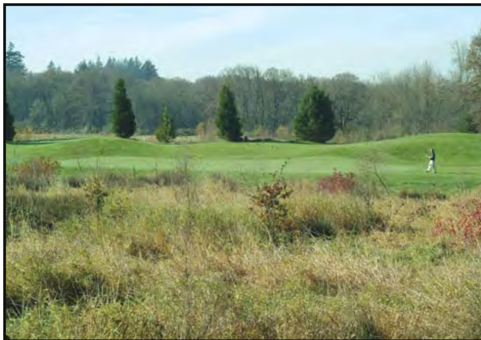
Green Mountain Golf Course is located just east of Vancouver near Camas.

The second and 17th are unique in that they both have two greens. One green plays much shorter than the other, giving both the low and high handicap players