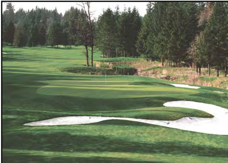
Marvin Road Golf & Batting Range (top) and Camas Meadows are popular with golfers.