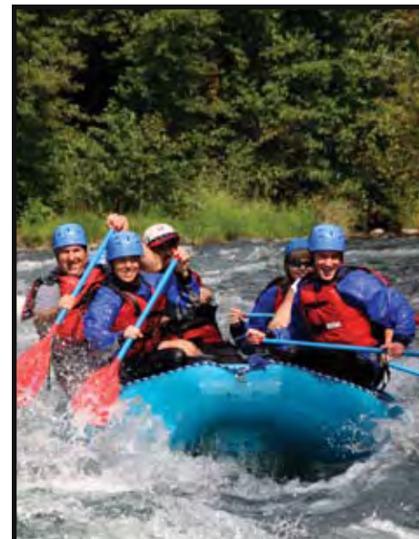
A side trip to Wolf Haven (near Olympia) or river rafting are good options to try.