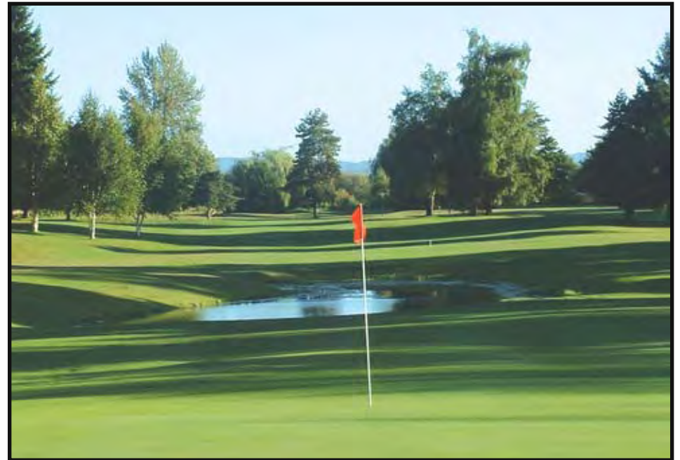
Tri-Mountain (top) and Riverside (bottom) are two courses close to Interstate-5.