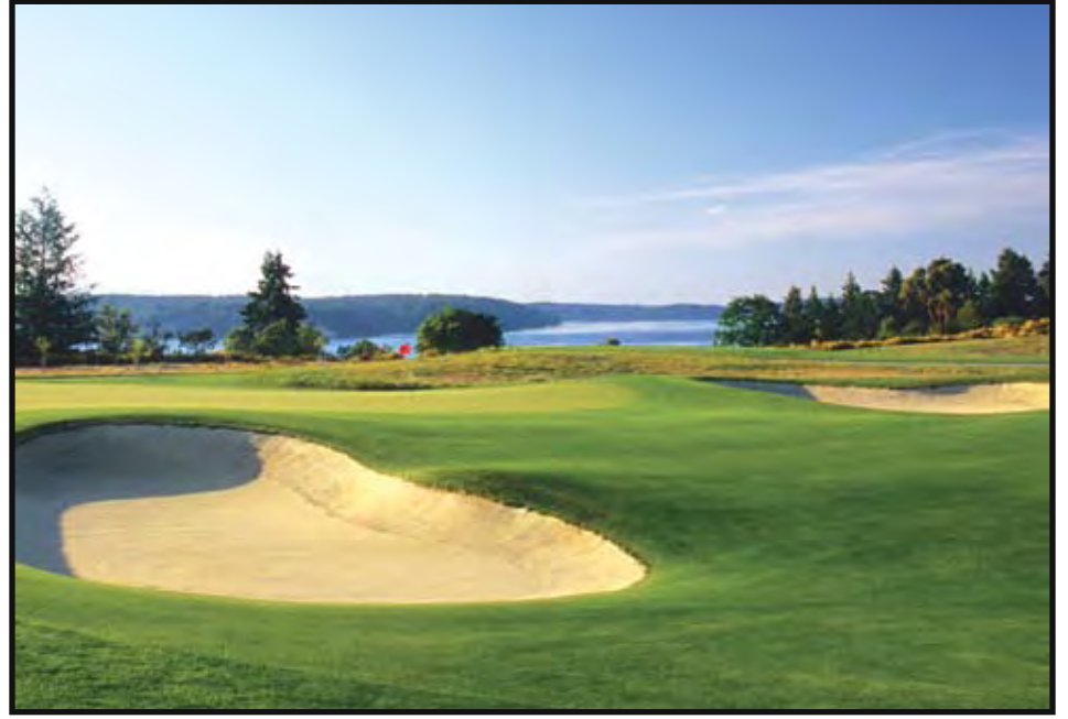
The Home Course in DuPont was a host for the United States Amateur in August.

This is a must play course if you are in the Aberdeen area. The course will surprise you with its character and the variety of shots you will use around this track.