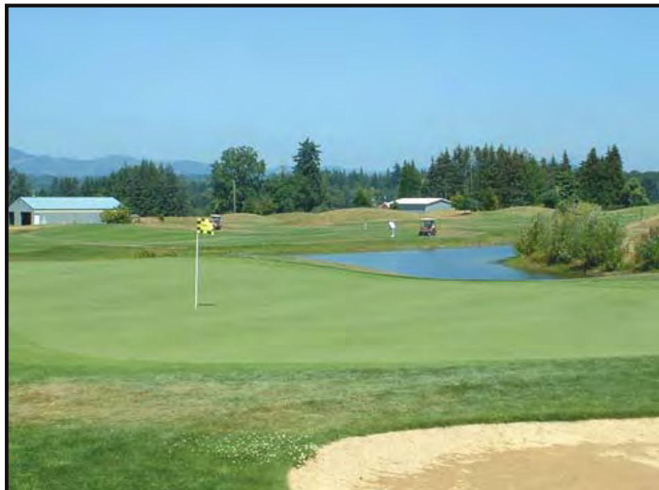
Camas Meadows in Camas, Wash. (top) and Tri-Mountain in Ridgefield are two reasons that Southwest Washington is becoming an enjoyable area for a golf destination.