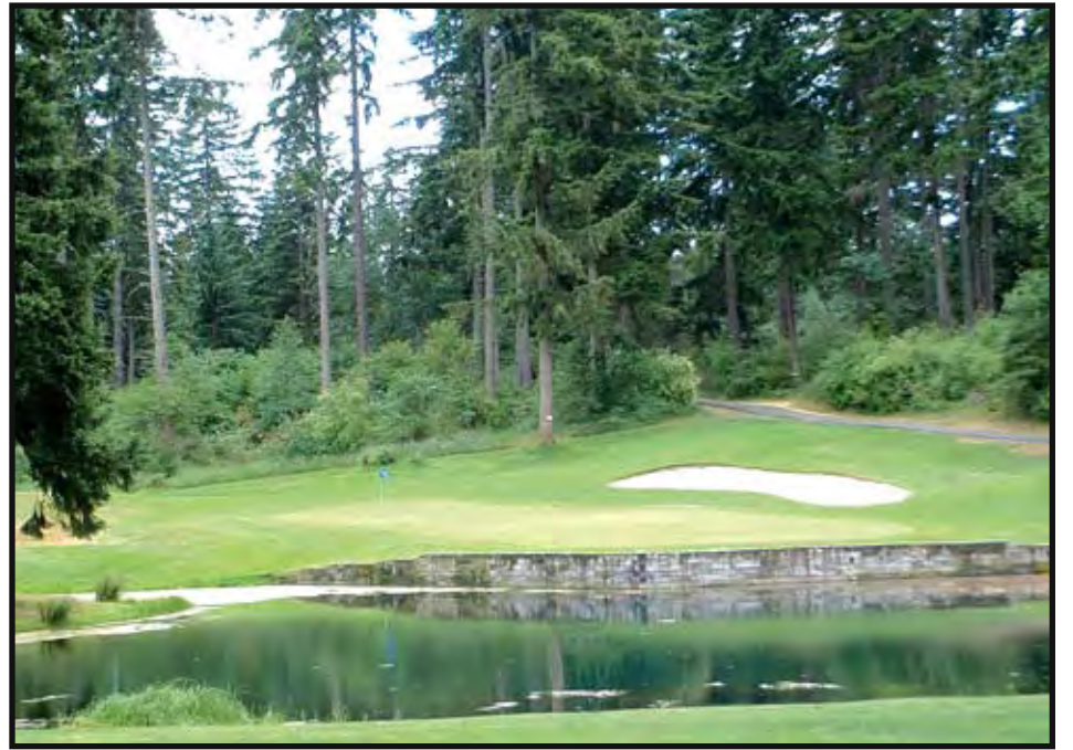
Eagle's Pride Golf Course at Fort Lewis has become a hit after opening to the public.

• Royal Oaks Country Club: This club in Vancouver is considered one of the top courses in the Pacific Northwest. It opened in the 1940s and hosts some of the Northwest's top events.