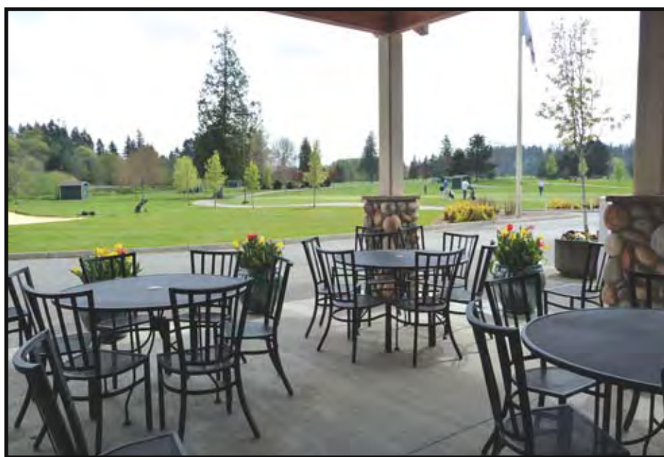
Tumwater Golf Course is a popular place and located a wedge away from I-5.