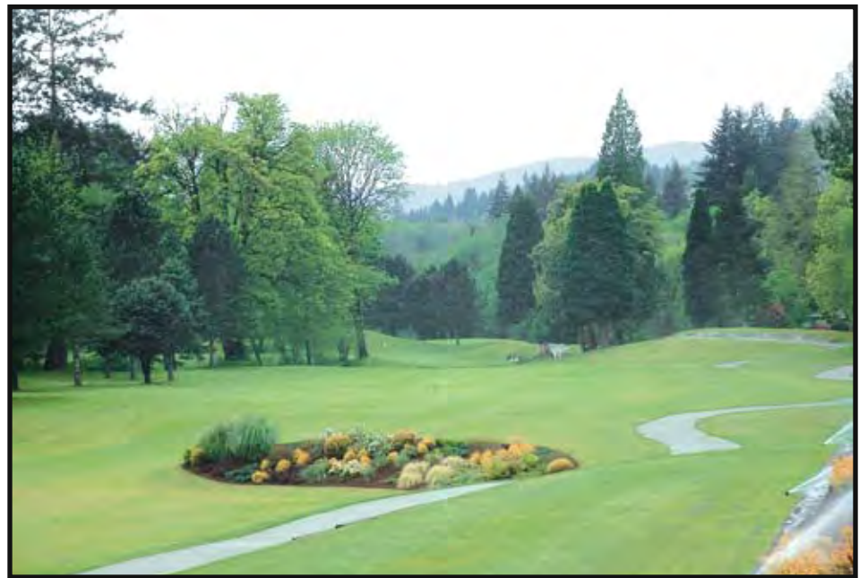
Lewis River Golf Course in Woodland is like a walk through the park.